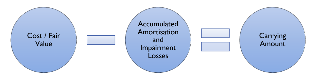
Figure 1: Cost Model Equation

After initial recognition, an intangible asset shall be carried at its cost less any accumulated amortisation and any accumulated impairment losses.