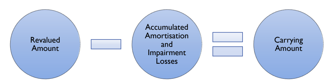
Figure 2: Revaluation Model Equation

After initial recognition, an intangible asset shall be carried at a revalued amount, being its fair value at the date of the revaluation less any subsequent accumulated amortisation. For revaluation purposes under this Accounting Policy, fair value shall be determined by reference to an active market. Revaluations shall then be made with sufficient regularity, within a period of maximum three to five years ensuring that at the reporting date the carrying amount of the asset does not differ materially from its fair value. If the fair value of a revalued asset differs materially from its carrying amount, further revaluation is necessary.