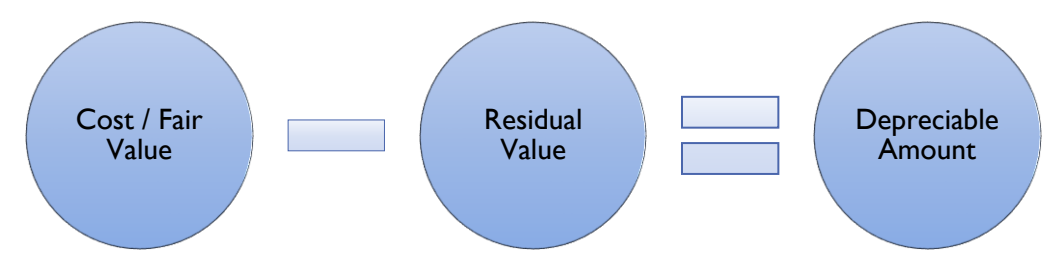
Figure 3: Depreciable Amount Equation